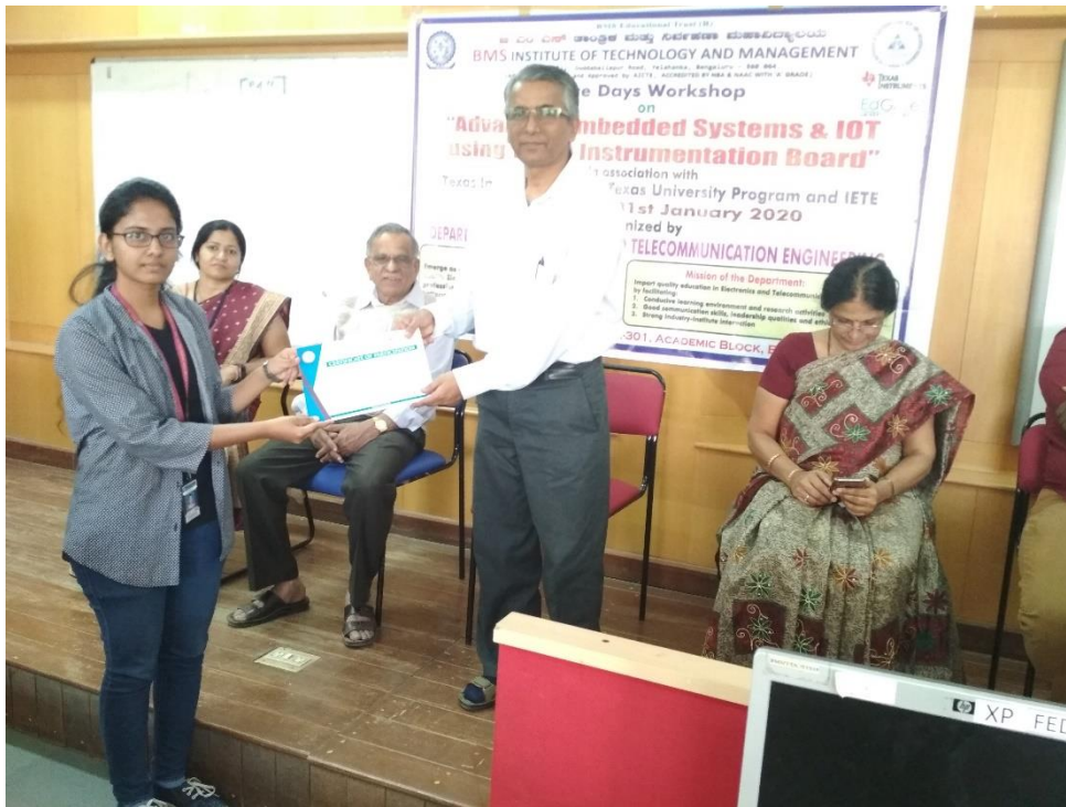
Certificate distribution to participants