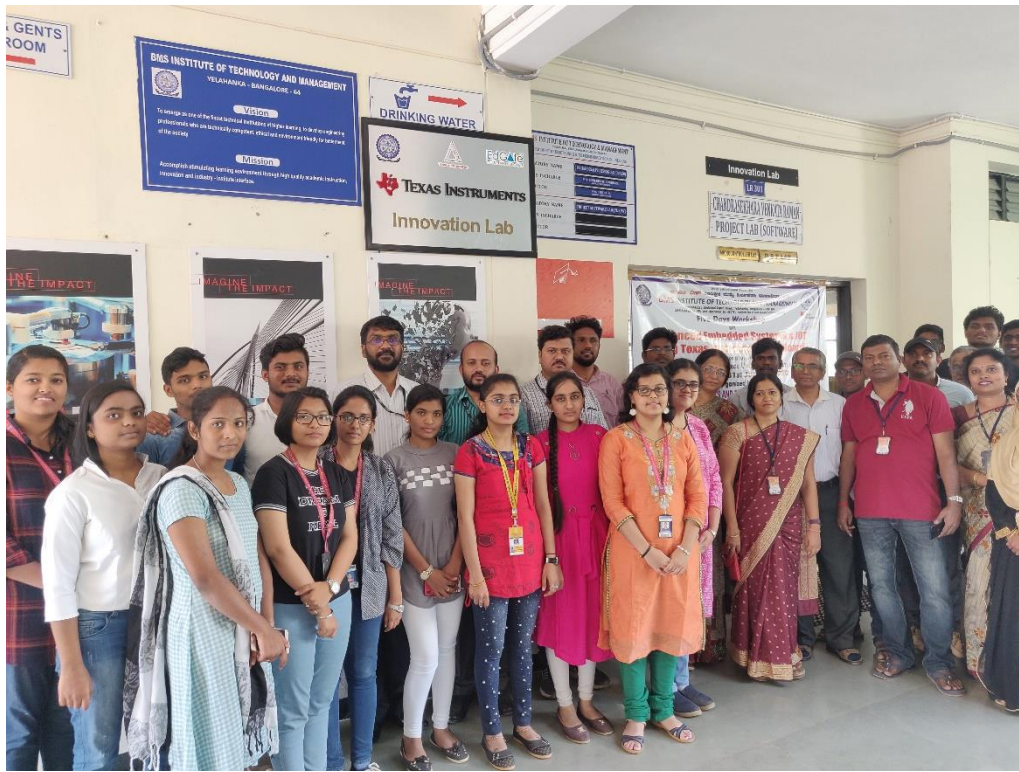
Participants with resource persons