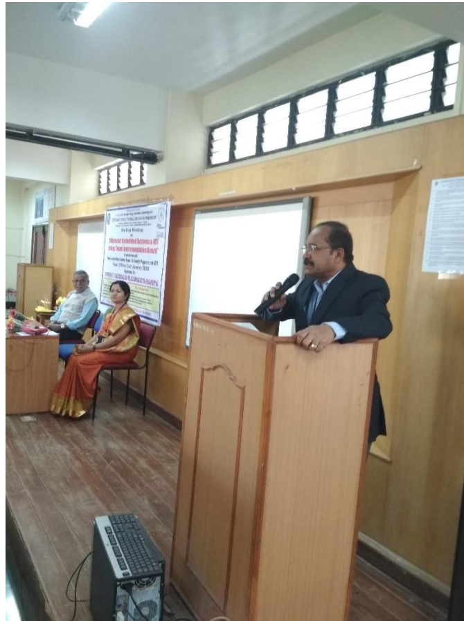
Inauguration of workshop

The workshop concluded with valedictory function .