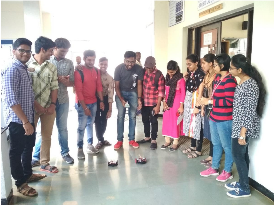
Participants involved in demonstrating applications using Robotics kit