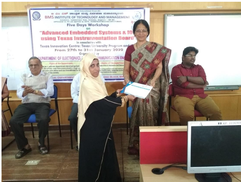
Certificate distribution to participants